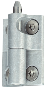
HINGE-10L and HINGE-10R HINGE-11L and HINGE-11R HINGE-12L and HINGE-12R

For use with all EXB & EXBLT series boxes. Set of two hinges installed on flanged enclosures for easier and safer installation and maintenance of internal components.